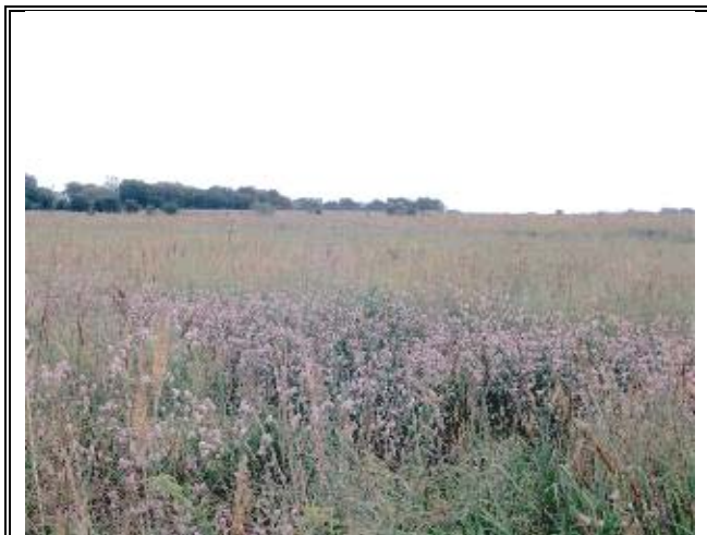
Figure 2. Smartweed, a vital food source for migrating waterfowl, blooming at Verona WPA.

The Verona WPA and WRP restorations have been completed. The Ducks Unlimited properties have been acquired and restoration work will be completed on them over the next few years. Restoration work will include removal of sediment and trees, filling-in of a reuse pit, and reseeding disturbed areas.