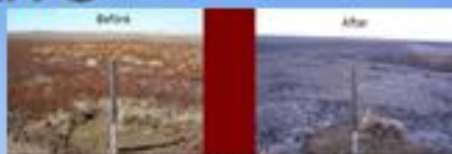
Before After Exposed sediments and erosion promoting scouring 25 days after