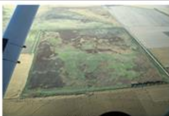
Canada thistle project on Funk WPA 2017